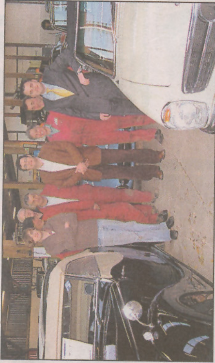
CRAFTSMEN ALL: The staff at the Classic and Sportscar Centre near Malton.

The company is based in West Knaption, near Malton, and at their premises visitors can step back in time through a fantastic selection of beautifully preserved classic and sports models. The range includes examples from famous names like Bentley,